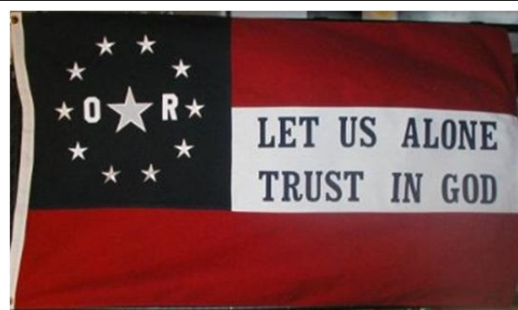
Irish 6 th La Inf. CSA

Sound monetary policy as described in Reclaiming Liberty is the answer to elites manipulating our money supply to their benefit. With your help the first step to a liberty based society will be taken in 2020.